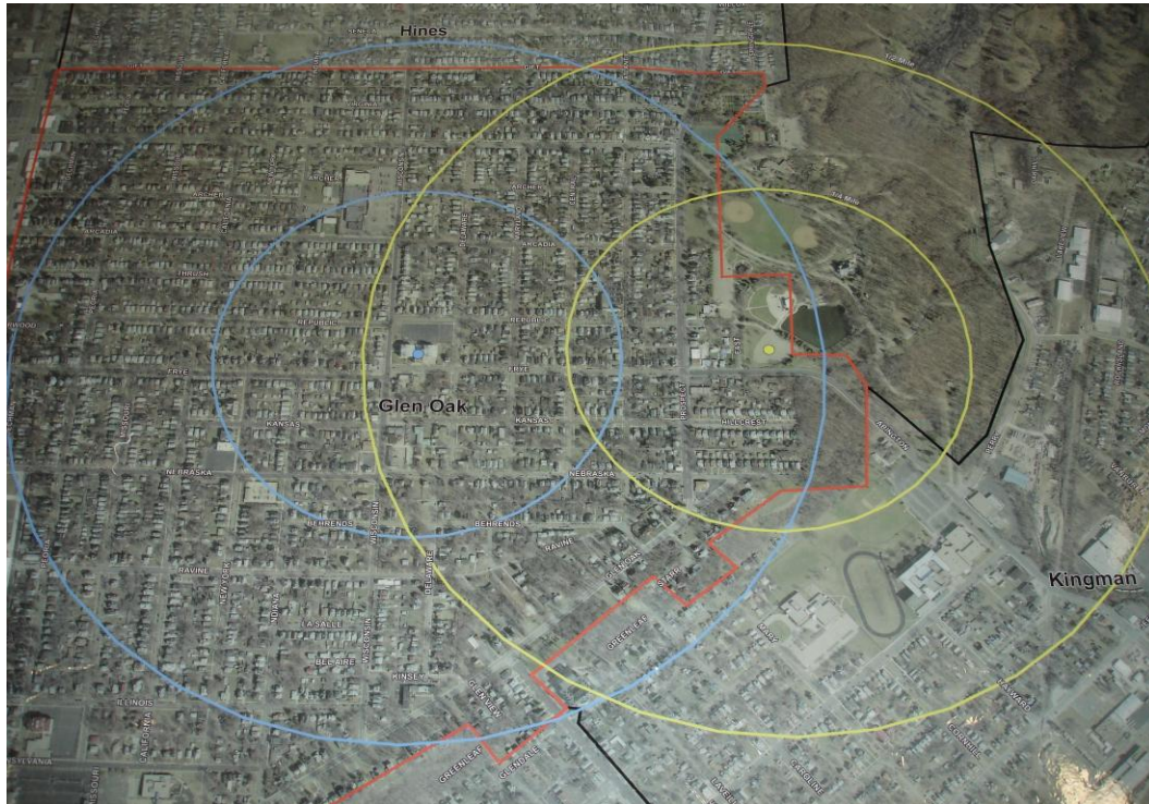
This aerial photograph developed by Tri-County Planning May of 2006

Achieving these goals will require unprecedented cooperation which we feel could occur with sound community leadership. There are ample opportunities for partnerships to make the Glen Oak neighborhood and Glen Oak School successful. Broad-based community involvement, using established best-practice guidelines, will create trust leading to ownership by the various stakeholders. We urge all involved to consider the significance of the Heart of Peoria Plan while making decisions about Peoria's future.